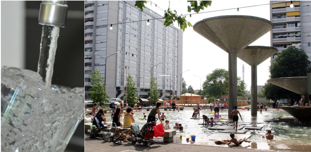
Figure 1. Images depicting NAIADES use cases that require water quality forecast. The image on the left represents drinking water for the Treatments suggestions use case. The image on the right shows Carouge Fontaine des Tours.